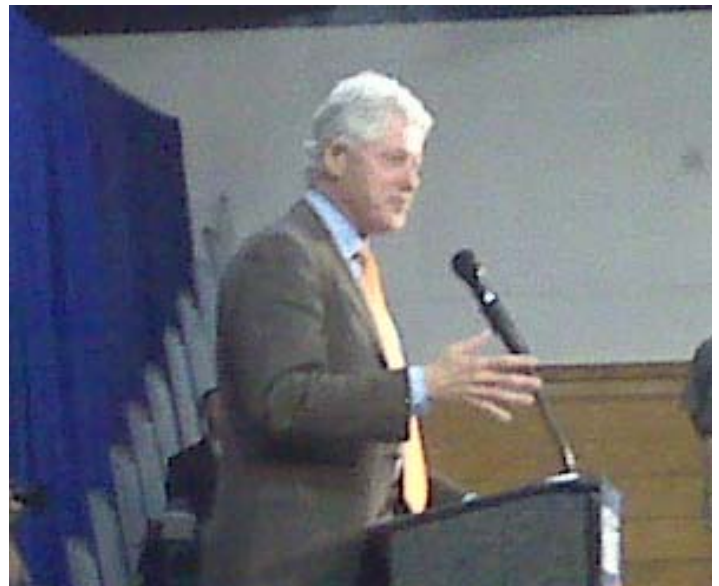
Bill Clinton Stumps Again in Oregon For Hilary Clinton As Oregon Primary Looms.

I want to be a PCP because: I want to get to work!