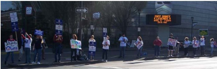
Barak Obama supporters gathered Friday to cheer on their candidate before the beginning of the convention.