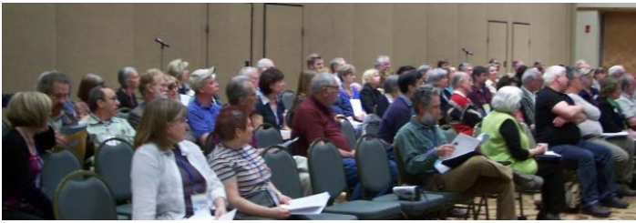
A roomful of Democrats get a briefing on the upcoming Oregon Presidential Primary Delegate selection process.